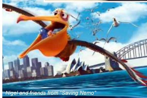
Nigel and friends from "Saving Nemo"