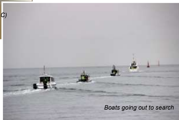
Boats going out to search