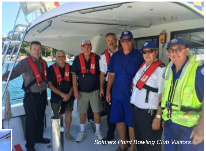
Soldiers Point Bowling Club Visitors.

Projects. Several projects have been initiated to deliver key outcomes for the Unit.