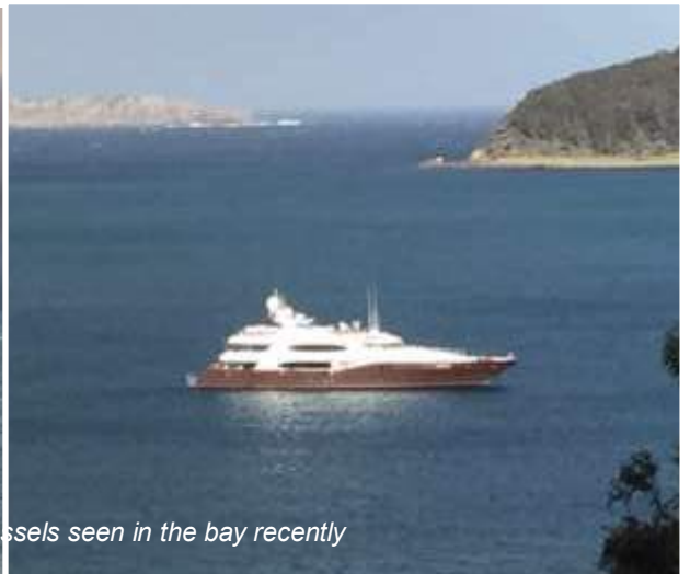
Two luxurious vessels seen in the bay recently