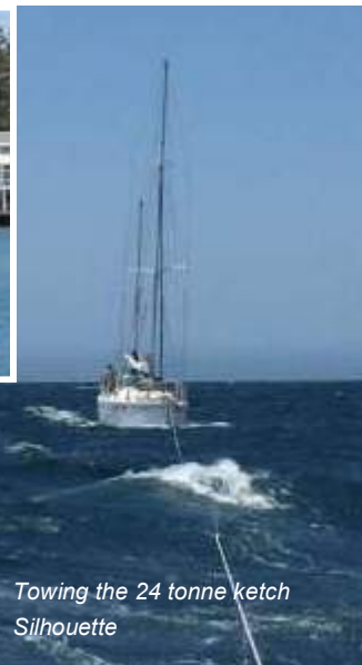
Towing the 24 tonne ketch Silhouette

During October we assisted the RAAF Rescue helicopter train their crews. PS31 was out on the water with the Helicopter overhead lowering personnel onto the deck.