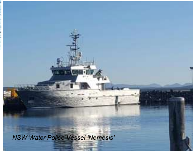
NSW Water Police Vessel 'Nemesis'

training at the Radio Base. We hope our new members are enjoying their time in serving the boating community and helping make our waterways safer.