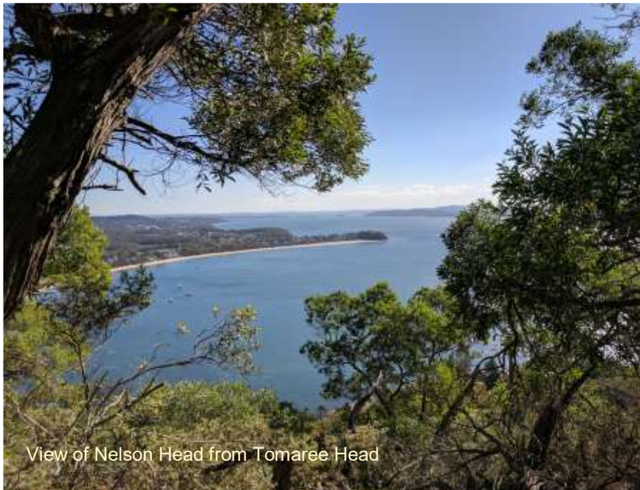
View of Nelson Head from Tomaree Head