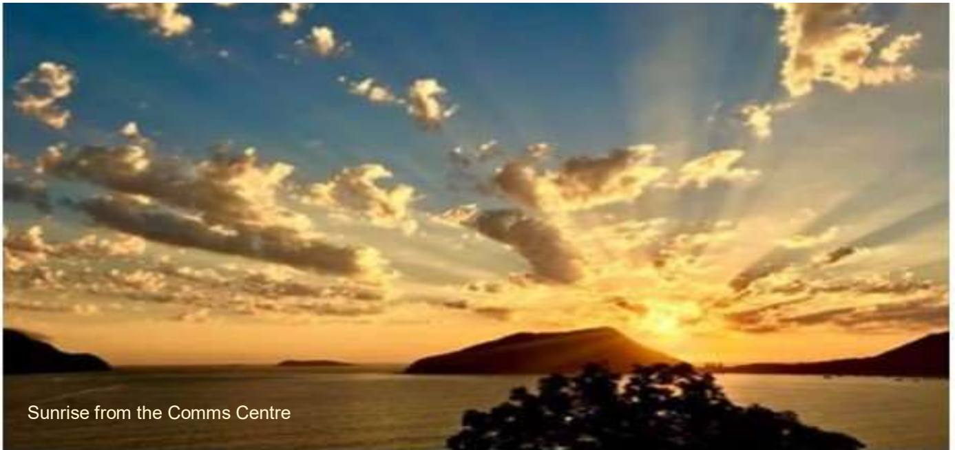
Sunrise from the Comms Centre