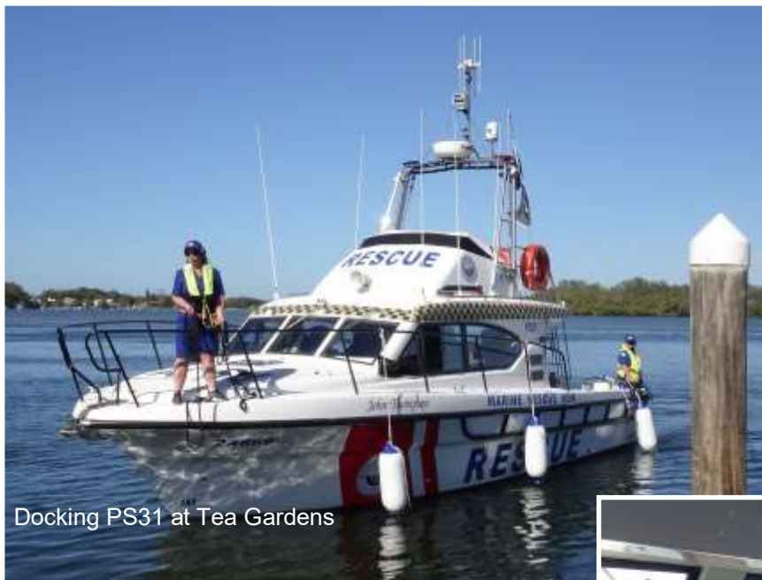
Docking PS31 at Tea Gardens