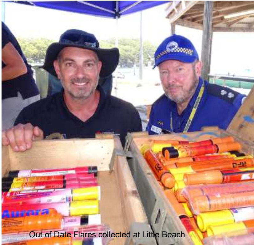
Out of Date Flares collected at Little Beach