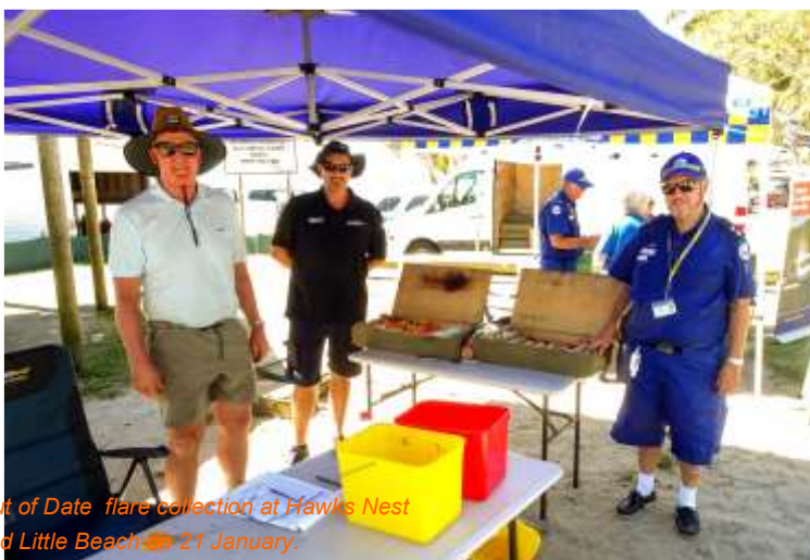
Out of Date flare collection at Hawks Nest and Little Beach on 21 January.