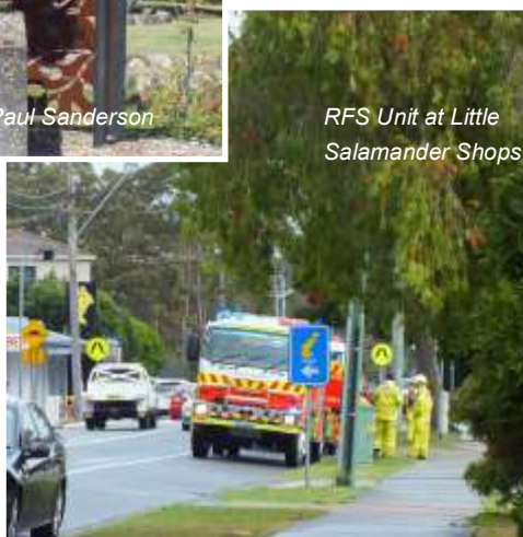
RFS Unit at Little Salamander Shops