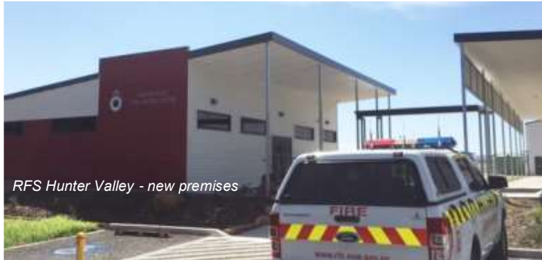
RFS Hunter Valley - new premises

top 1000 by year's end. That's an incredible effort from our volunteers in the Comms Centre ... and also a sound reliable source of income.