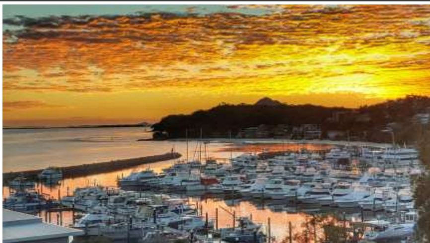
Sunrise from above D'Albora Marina