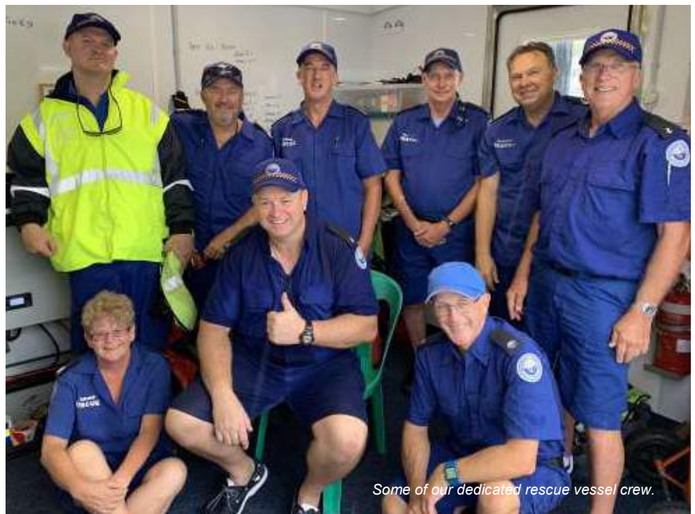
Some of our dedicated rescue vessel crew.