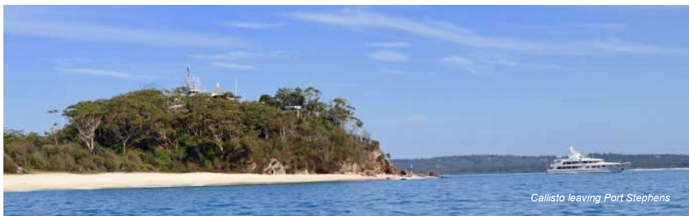
Callisto leaving Port Stephens