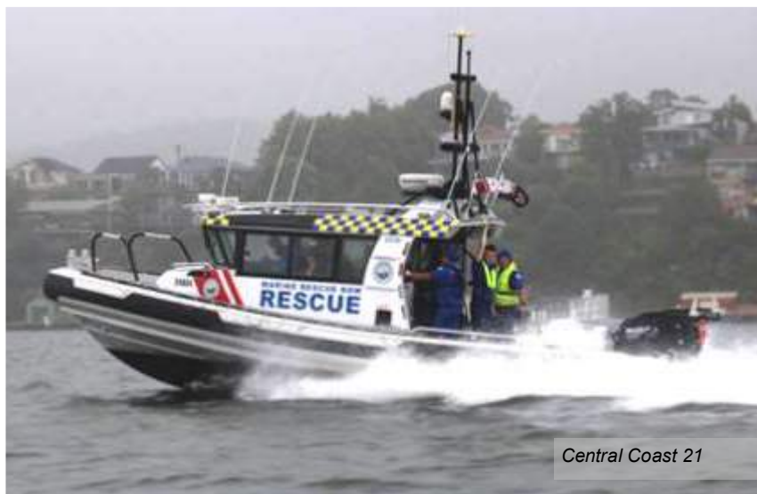
Central Coast 21